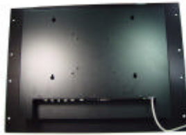
tapped screw holes, standard VESA 75 & 100 wallmount compliant extra 4 hook-mounting holes