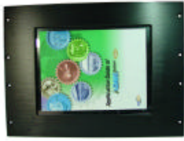
Standard industrial 19" Rackmount TFT 15" LCD Monitor 10mm Aluminum Alloy Bezel IP-56, 65, NEMA 4, 12 water-resistant